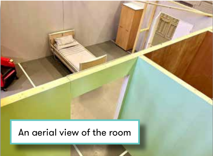
An aerial view of the room