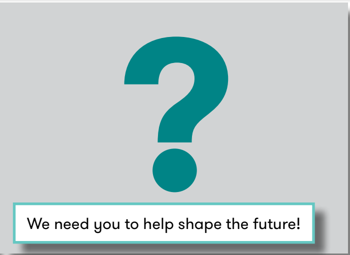
We need you to help shape the future!