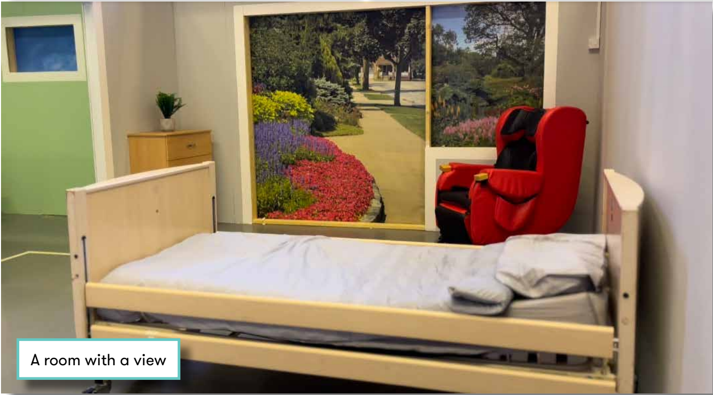
A room with a view